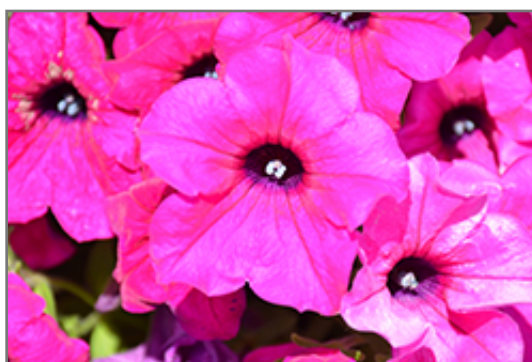
Surfinia Sumo Plum Petunia flowers