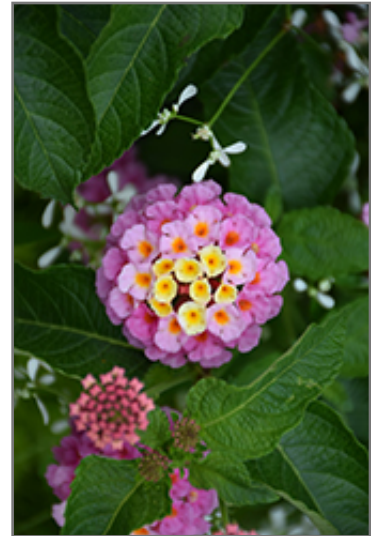
Luscious Pinkberry Blend Lantana flowers

Luscious Pinkberry Blend Lantana is a fine choice for the garden, but it is also a good selection for planting in outdoor containers and hanging baskets. It is often used as a 'filler' in the 'spiller-thriller-filler' container combination, providing a mass of flowers against which the thriller plants stand out. Note that when growing plants in outdoor containers and baskets, they may require more frequent waterings than they would in the yard or garden.