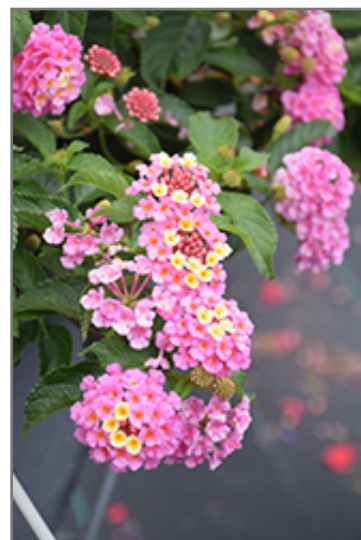
Luscious Pinkberry Blend Lantana flowers