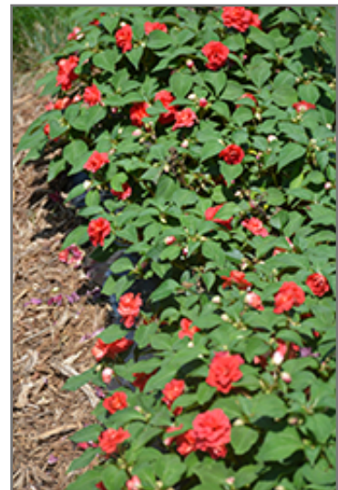
Rockapulco Red Impatiens in bloom