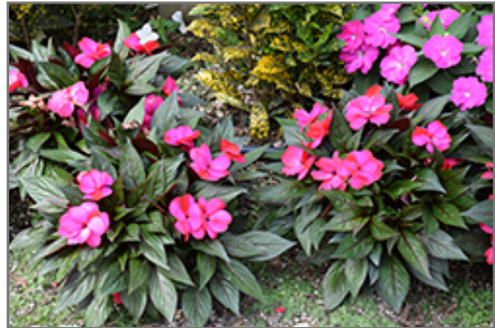
Infinity Blushing Lilac New Guinea Impatiens in bloom

Infinity Blushing Lilac New Guinea Impatiens will grow to be about 12 inches tall at maturity, with a spread of 12 inches. When grown in masses or used as a bedding plant, individual plants should be spaced approximately 8 inches apart. Its foliage tends to remain dense right to the ground, not requiring facer plants in front. This fast-growing annual will normally live for one full growing season, needing replacement the following year.