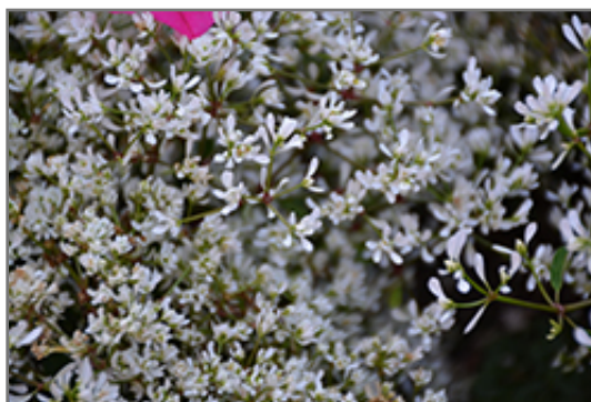
Diamond Delight Euphorbia flowers