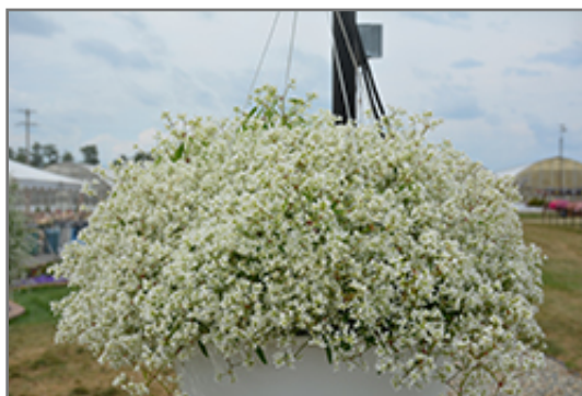
Diamond Delight Euphorbia in bloom