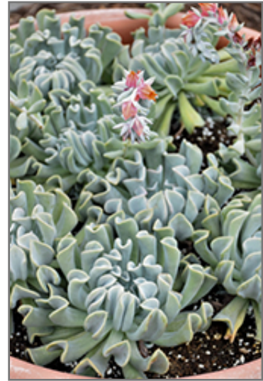
Topsy Turvy Echeveria in bloom

This plant is not reliably hardy in our region, and certain restrictions may apply; contact the store for more information.