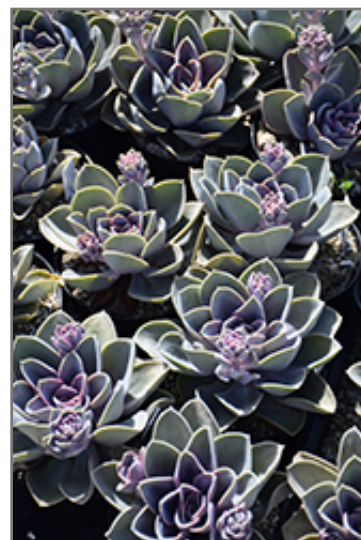
Perle Von Nurnberg Echeveria

Perle Von Nurnberg Echeveria is recommended for the following landscape applications;