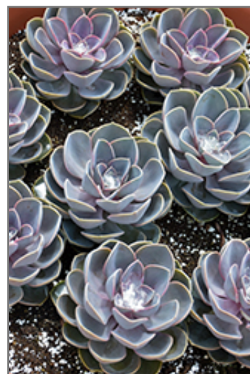
Perle Von Nurnberg Echeveria