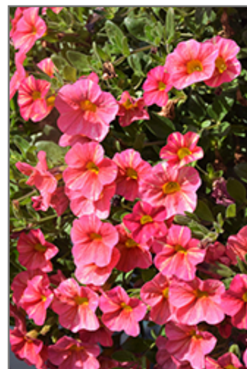
Superbells Tropical Sunrise Calibrachoa flowers

This plant will require occasional maintenance and upkeep. Trim off the flower heads after they fade and die to encourage more blooms late into the season. It is a good choice for attracting bees and hummingbirds to your yard, but is not particularly attractive to deer who tend to leave it alone in favor of tastier treats. It has no significant negative characteristics.