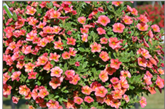
Superbells Tropical Sunrise Calibrachoa flowers

Superbells Tropical Sunrise Calibrachoa will grow to be about 10 inches tall at maturity, with a spread of 24 inches. When grown in masses or used as a bedding plant, individual plants should be spaced approximately 12 inches apart. Its foliage tends to remain low and dense right to the ground. This fast-growing annual will normally live for one full growing season, needing replacement the following year.