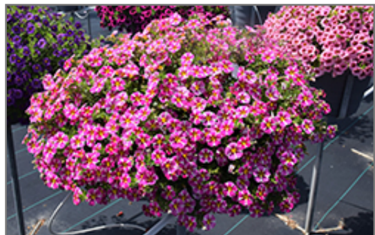
Superbells Rising Star Calibrachoa flowers