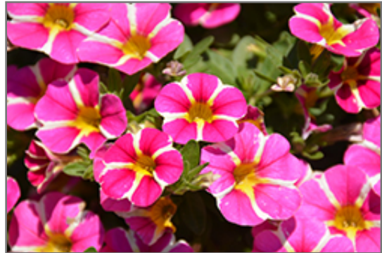
Superbells Rising Star Calibrachoa flowers

This plant will require occasional maintenance and upkeep. Trim off the flower heads after they fade and die to encourage more blooms late into the season. It is a good choice for attracting bees and hummingbirds to your yard, but is not particularly attractive to deer who tend to leave it alone in favor of tastier treats. It has no significant negative characteristics.