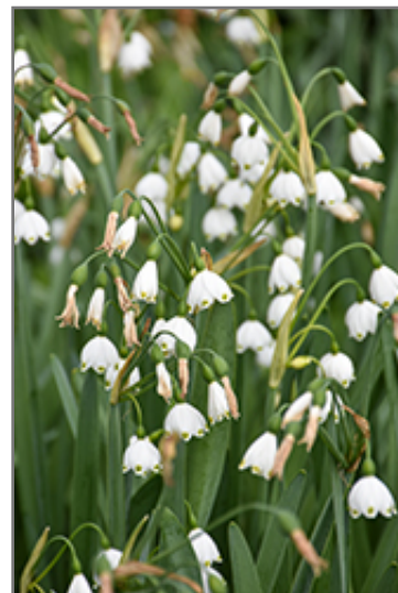
Summer Snowflake flowers

Summer Snowflake is recommended for the following landscape applications;