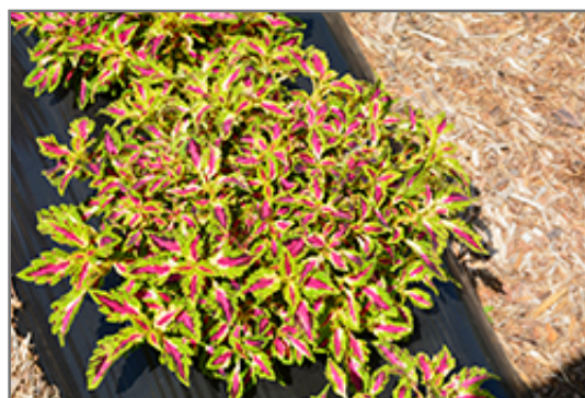
Terra Nova Jitters Coleus