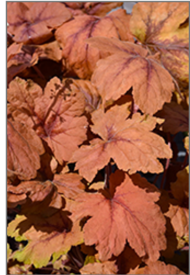
Pumpkin Spice Foamy Bells foliage

Pumpkin Spice Foamy Bells is recommended for the following landscape applications;