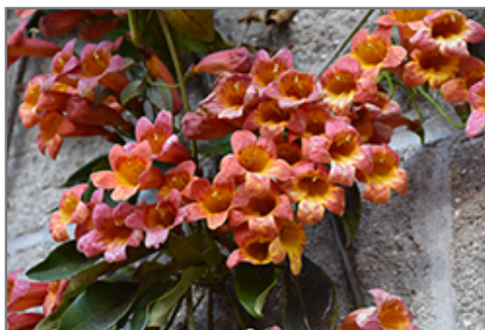
Tangerine Beauty Cross Vine flowers