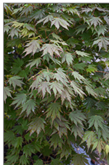
Northern Glow Maple foliage