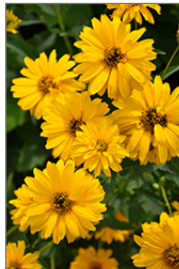
Summer Sun False Sunflower flowers

Summer Sun False Sunflower is recommended for the following landscape applications;