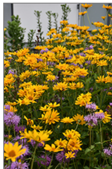
Summer Sun False Sunflower flowers