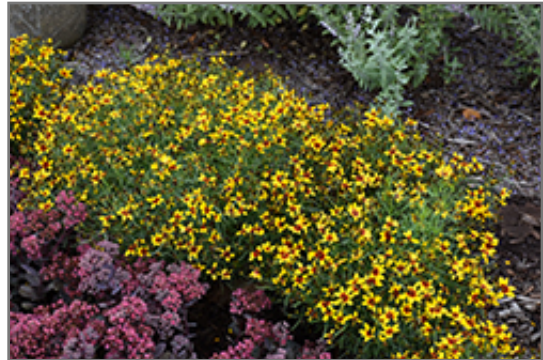
Sizzle And Spice Curry Up Tickseed in bloom

Sizzle And Spice Curry Up Tickseed will grow to be about 15 inches tall at maturity, with a spread of 24 inches. Its foliage tends to remain dense right to the ground, not requiring facer plants in front. It grows at a medium rate, and under ideal conditions can be expected to live for approximately 8 years. As an herbaceous perennial, this plant will usually die back to the crown each winter, and will regrow from the base each spring. Be careful not to disturb the crown in late winter when it may not be readily seen!