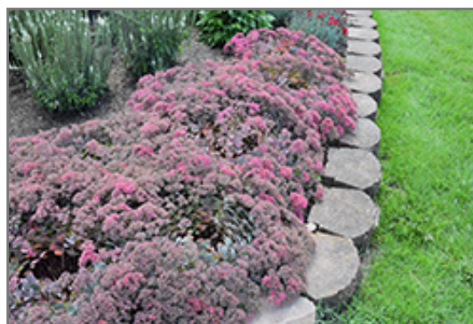
Popstar Stonecrop in bloom