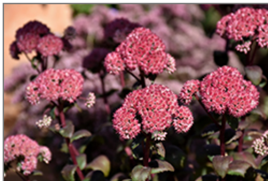
Desert Red Stonecrop flowers

Desert Red Stonecrop is a dense herbaceous perennial with an upright spreading habit of growth. Its relatively coarse texture can be used to stand it apart from other garden plants with finer foliage.