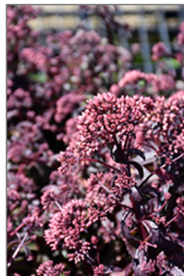
Desert Red Stonecrop flowers

This plant is not reliably hardy in our region, and certain restrictions may apply; contact the store for more information.