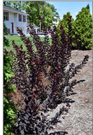
Winecraft Black Smokebush

This plant is not reliably hardy in our region, and certain restrictions may apply; contact the store for more information.