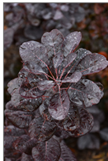
Winecraft Black Smokebush foliage