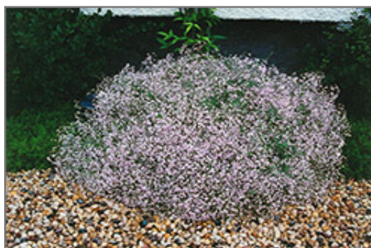
Pink Fairy Baby's Breath in bloom