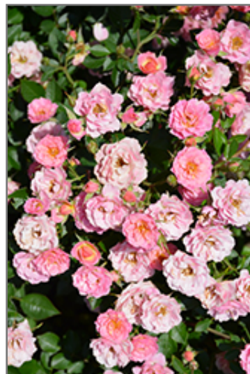
Oso Easy Petit Pink flowers