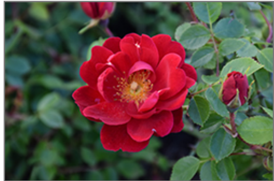
Oso Easy Urban Legend Rose flowers

This plant is not reliably hardy in our region, and certain restrictions may apply; contact the store for more information.