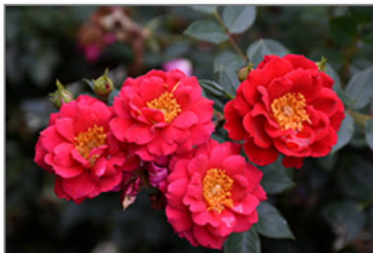
Oso Easy Urban Legend Rose flowers

Oso Easy Urban Legend Rose is recommended for the following landscape applications;