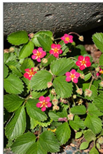
Lipstick Strawberry flowers

Lipstick Strawberry has masses of beautiful cherry red daisy flowers with yellow eyes along the stems from late spring to early summer, which are most effective when planted in groupings. Its tomentose round compound leaves remain green in colour throughout the season. It features an abundance of magnificent red berries from mid spring to mid fall.