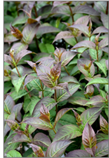
Kodiak Black Diervilla foliage

This plant is not reliably hardy in our region, and certain restrictions may apply; contact the store for more information.