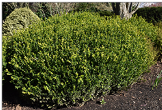
Green Beauty Boxwood