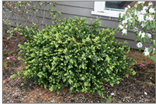
Green Beauty Boxwood

This shrub does best in full sun to partial shade. It prefers to grow in average to moist conditions, and shouldn't be allowed to dry out. It is not particular as to soil type or pH. It is highly tolerant of urban pollution and will even thrive in inner city environments, and will benefit from being planted in a relatively sheltered location. This particular variety is an interspecific hybrid.