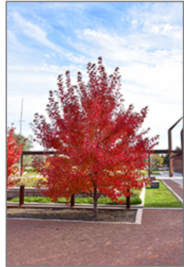
Regal Celebration Maple in fall