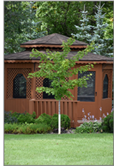
Regal Celebration Maple

This plant is not reliably hardy in our region, and certain restrictions may apply; contact the store for more information.