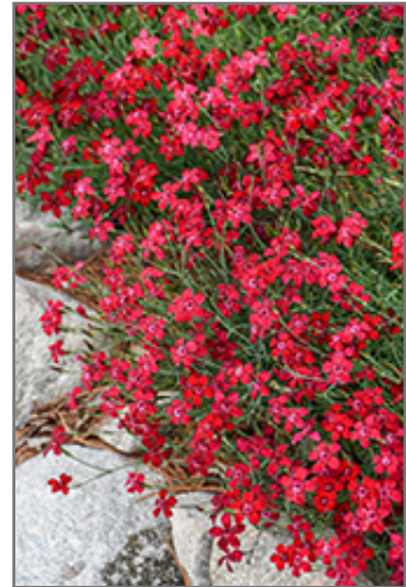
Flashing Light Maiden Pinks flowers

Flashing Light Maiden Pinks is recommended for the following landscape applications;