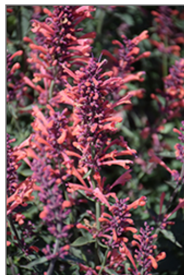
Kudos Coral Hyssop flowers