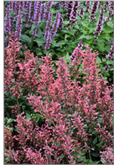
Kudos Coral Hyssop flowers

Kudos Coral Hyssop is a fine choice for the garden, but it is also a good selection for planting in outdoor pots and containers. With its upright habit of growth, it is best suited for use as a 'thriller' in the 'spiller-thriller-filler' container combination; plant it near the center of the pot, surrounded by smaller plants and those that spill over the edges. Note that when growing plants in outdoor containers and baskets, they may require more frequent waterings than they would in the yard or garden.