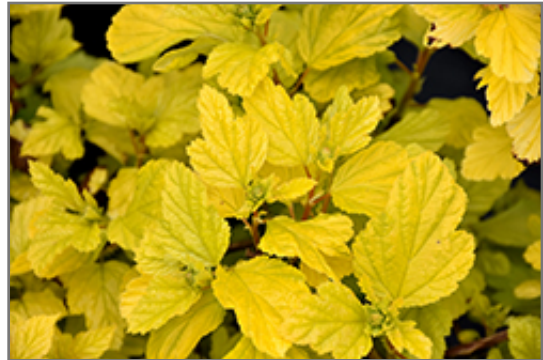
Festivus Gold Ninebark foliage

This shrub does best in full sun to partial shade. It is very adaptable to both dry and moist locations, and should do just fine under average home landscape conditions. It is not particular as to soil type or pH. It is highly tolerant of urban pollution and will even thrive in inner city environments. This is a selection of a native North American species.