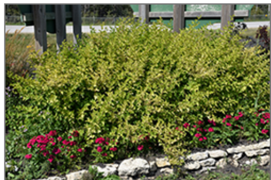
Festivus Gold Ninebark