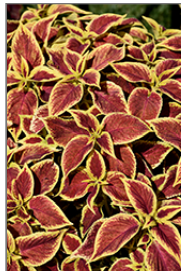
Crimson Gold Coleus foliage

Crimson Gold Coleus is recommended for the following landscape applications;