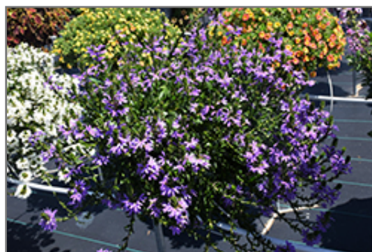
Scalora Brilliant Fan Flower in bloom