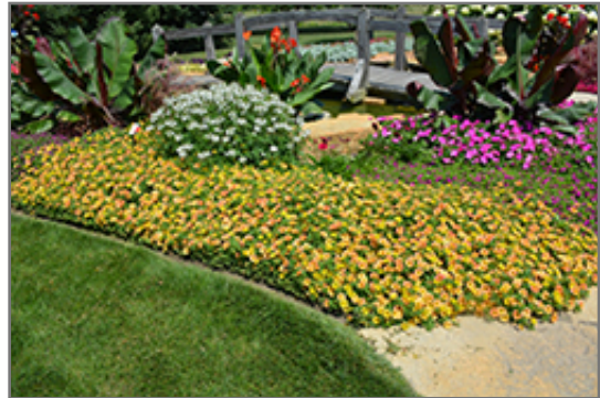
Supertunia Honey Petunia in bloom

Supertunia Honey Petunia is a fine choice for the garden, but it is also a good selection for planting in outdoor containers and hanging baskets. Because of its trailing habit of growth, it is ideally suited for use as a 'spiller' in the 'spiller-thriller-filler' container combination; plant it near the edges where it can spill gracefully over the pot. Note that when growing plants in outdoor containers and baskets, they may require more frequent waterings than they would in the yard or garden.