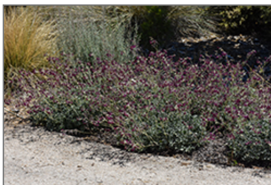
South African Geranium in bloom