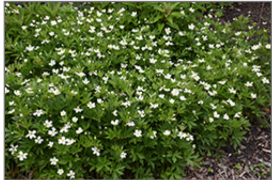
Windflower in bloom

Windflower will grow to be about 12 inches tall at maturity, with a spread of 18 inches. Its foliage tends to remain dense right to the ground, not requiring facer plants in front. It grows at a fast rate, and under ideal conditions can be expected to live for approximately 10 years. As an herbaceous perennial, this plant will usually die back to the crown each winter, and will regrow from the base each spring. Be careful not to disturb the crown in late winter when it may not be readily seen!