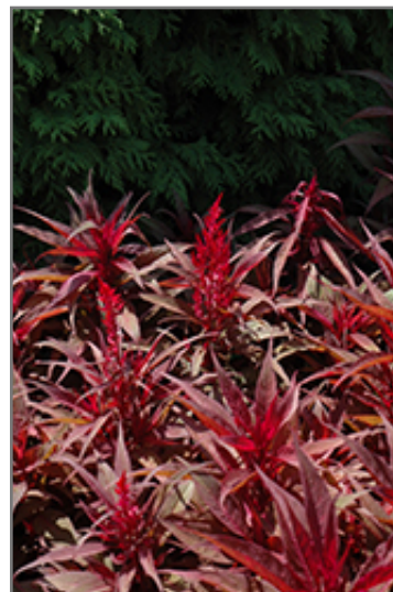
Dragon's Breath Plumed Celosia flowers

Dragon's Breath Plumed Celosia is recommended for the following landscape applications;