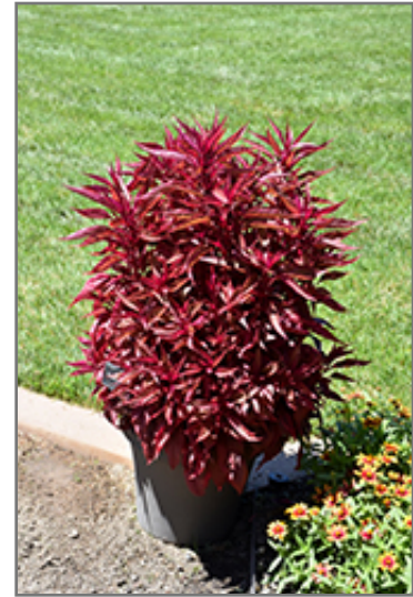
Dragon's Breath Plumed Celosia

Dragon's Breath Plumed Celosia is a fine choice for the garden, but it is also a good selection for planting in outdoor containers and hanging baskets. With its upright habit of growth, it is best suited for use as a 'thriller' in the 'spiller-thriller-filler' container combination; plant it near the center of the pot, surrounded by smaller plants and those that spill over the edges. Note that when growing plants in outdoor containers and baskets, they may require more frequent waterings than they would in the yard or garden.