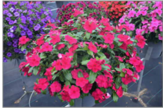
Valiant Burgundy Vinca in bloom

Valiant Burgundy Vinca will grow to be about 12 inches tall at maturity, with a spread of 18 inches. Its foliage tends to remain dense right to the ground, not requiring facer plants in front. Although it's not a true annual, this fast-growing plant can be expected to behave as an annual in our climate if left outdoors over the winter, usually needing replacement the following year. As such, gardeners should take into consideration that it will perform differently than it would in its native habitat.