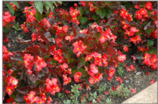
BabyWing Red Begonia flowers