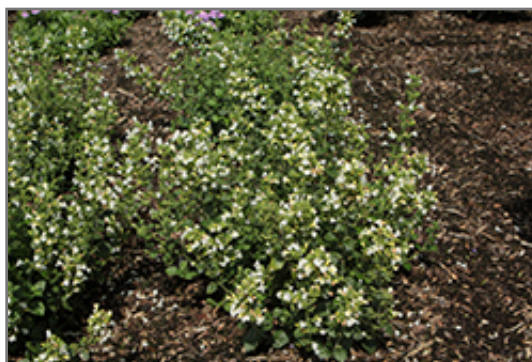
Marvelette White Dwarf Calamint in bloom