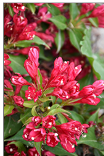
Crimson Kisses Weigela flowers