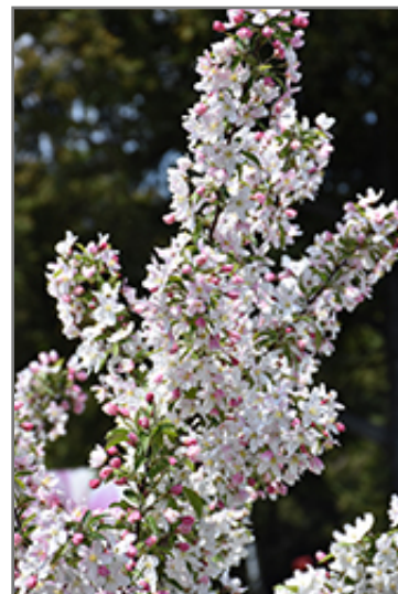
Lancelot Flowering Crab flowers