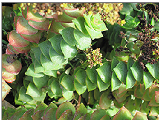
String Of Buttons foliage

String Of Buttons is recommended for the following landscape applications;