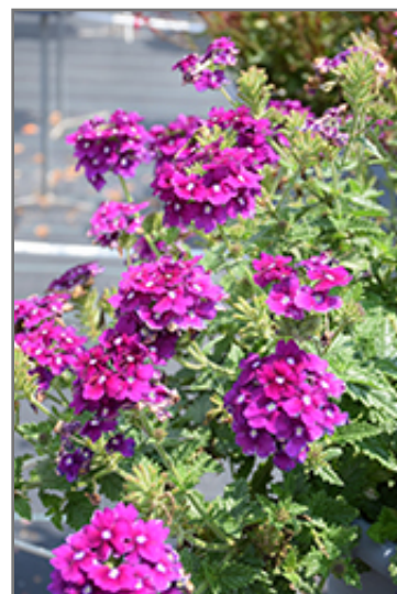
EnduraScape Purple Verbena flowers

EnduraScape Purple Verbena is recommended for the following landscape applications;