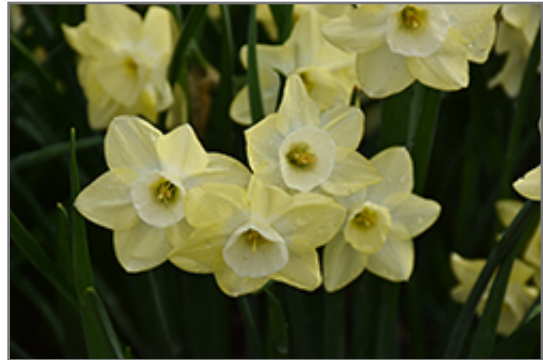
Stint Daffodil flowers