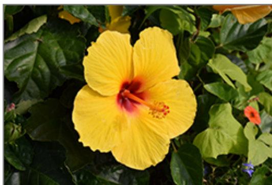
Sunny Wind Hibiscus flowers

This plant does best in full sun to partial shade. It requires an evenly moist well-drained soil for optimal growth, but will die in standing water. It is not particular as to soil type or pH. It is highly tolerant of urban pollution and will even thrive in inner city environments. Consider applying a thick mulch around the root zone in winter to protect it in exposed locations or colder microclimates. This is a selected variety of a species not originally from North America. It can be propagated by cuttings; however, as a cultivated variety, be aware that it may be subject to certain restrictions or prohibitions on propagation.