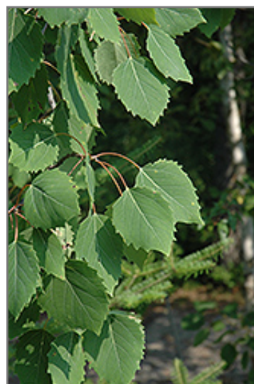
Bigtooth Aspen foliage