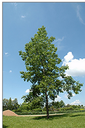
Bigtooth Aspen

Bigtooth Aspen will grow to be about 60 feet tall at maturity, with a spread of 40 feet. It has a high canopy with a typical clearance of 5 feet from the ground, and should not be planted underneath power lines. It grows at a fast rate, and under ideal conditions can be expected to live for 70 years or more.