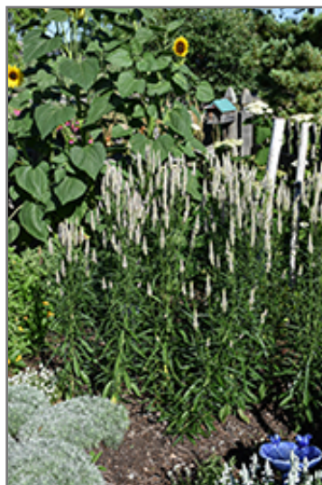
Flamingo Feather Celosia in bloom