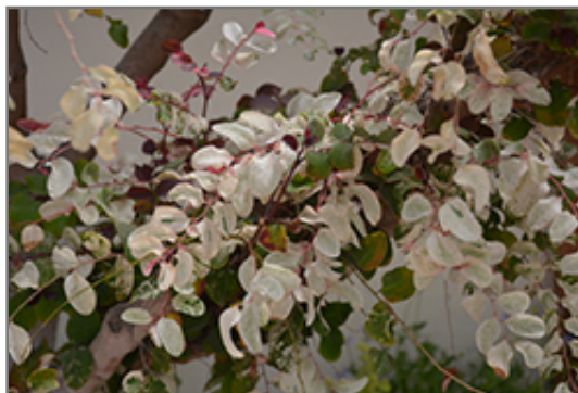
Red-leaved Snow Bush foliage