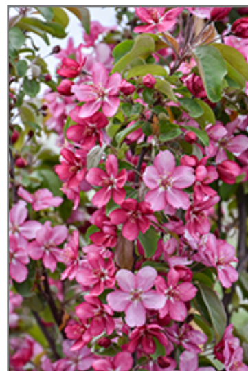
Red Barron Flowering Crab flowers