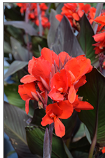
Cannova Bronze Scarlet Canna flowers

This plant is native to the tropics and prefers growing in moist environments with evenly warm conditions all year round. In our climate, it is usually grown as an outdoor annual in the garden or in a container. If you want it to survive the winter, it can be brought in to the house and provided with special care, and then returned to the garden the following season. In its preferred tropical habitat, it can grow to be around 4 feet tall at maturity, with a spread of 20 inches. However, when grown as an annual or when overwintered indoors, it can be expected to perform differently, and its exact height and spread will depend on many factors; you may wish to consult with our experts as to how it might perform in your specific application and growing conditions.