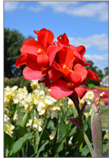
Cannova Bronze Scarlet Canna flowers

Cannova Bronze Scarlet Canna is a fine choice for the garden, but it is also a good selection for planting in outdoor pots and containers. With its upright habit of growth, it is best suited for use as a 'thriller' in the 'spiller-thriller-filler' container combination; plant it near the center of the pot, surrounded by smaller plants and those that spill over the edges. It is even sizeable enough that it can be grown alone in a suitable container. Note that when growing plants in outdoor containers and baskets, they may require more frequent waterings than they would in the yard or garden. Be aware that in our climate, most plants cannot be expected to survive the winter if left in containers outdoors, and this plant is no exception. Contact our experts for more information on how to protect it over the winter months.