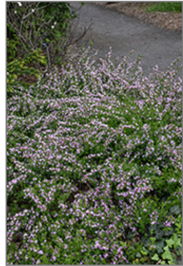
Purple Broom in bloom

This plant is not reliably hardy in our region, and certain restrictions may apply; contact the store for more information.