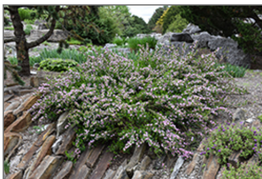
Purple Broom in bloom